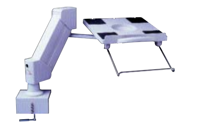
Desktop Monitor Arm MA-100 – Desktop

By getting the monitor off the desk, a great deal of space is freed up for productive work.