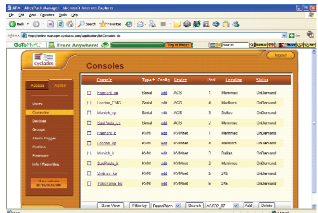
Figure 2. View of the AlterPath System management interface.